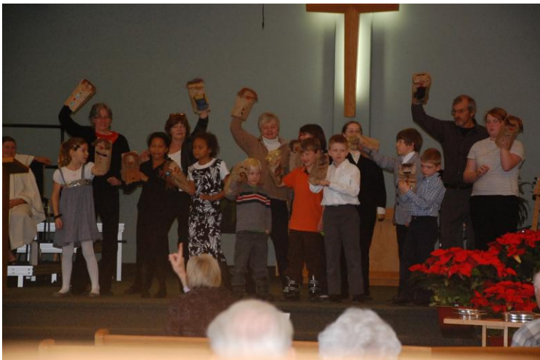
Nativity Performance by children and youth